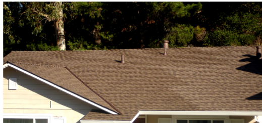
Staining Before Weathering

No. This is a cosmetic issue and will not affect the performance or long-term appearance of the shingles. Once the asphaltic oil staining has weathered-out, the shingles' original color will be restored.