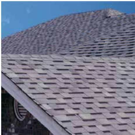
Before Flat, cut-up 3-tab strip shingles used at the hips and ridges