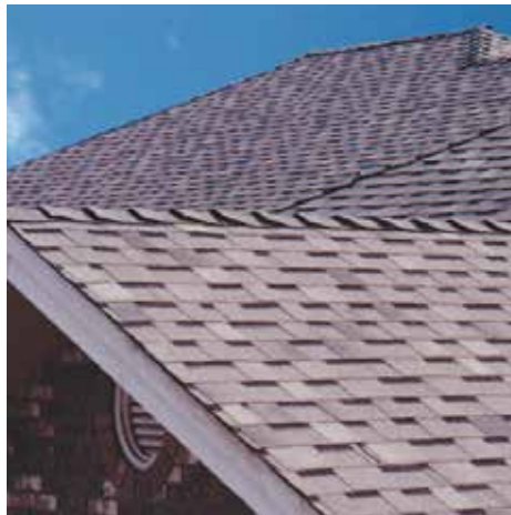
After A distinct, high-profile finishing look that also protects against leaks and shingle blow-offs