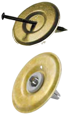
Drill-Tec™ RhinoBond® TPO XHD Plate