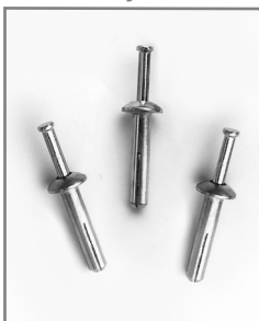
Drill-Tec™ Masonry Anchor