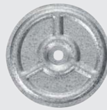
Drill-Tec™ 3" (76 mm) Ribbed Galvalume® Plate (Flat)