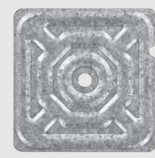
Drill-Tec™ 3" (76 mm) AccuTrac® Flat Plate