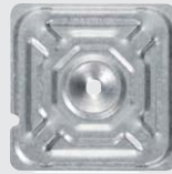
Drill-Tec™ 3" (76 mm) AccuTrac® Recessed Plate