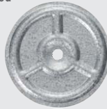
Drill-Tec™ 3" (76 mm) Steel Plate