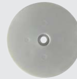
Drill-Tec™ 3" (76 mm) Plastic Locking Plate